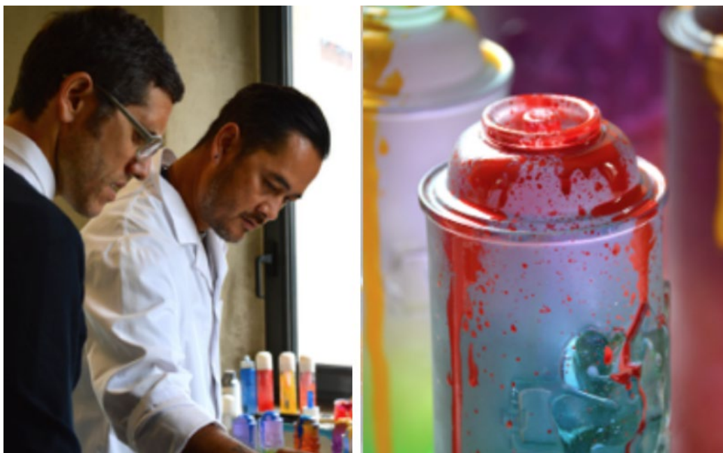
Kongo working with Daum team