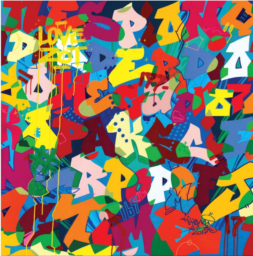
Lanmou pou zot, 100 x 100 cm, Mixed media on canvas