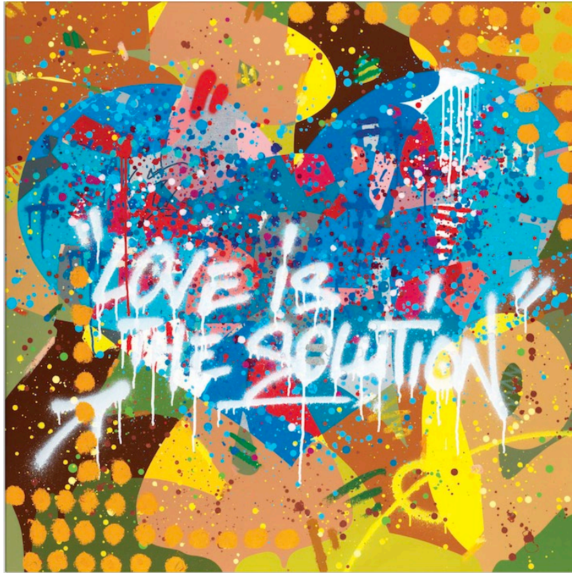
Solutions, 100 x 100 cm, Mixed media on canvas