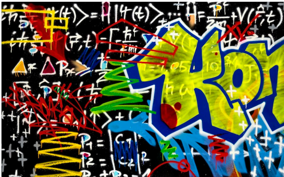
La formule, 130 x 210 cm, Mixed media on canvas