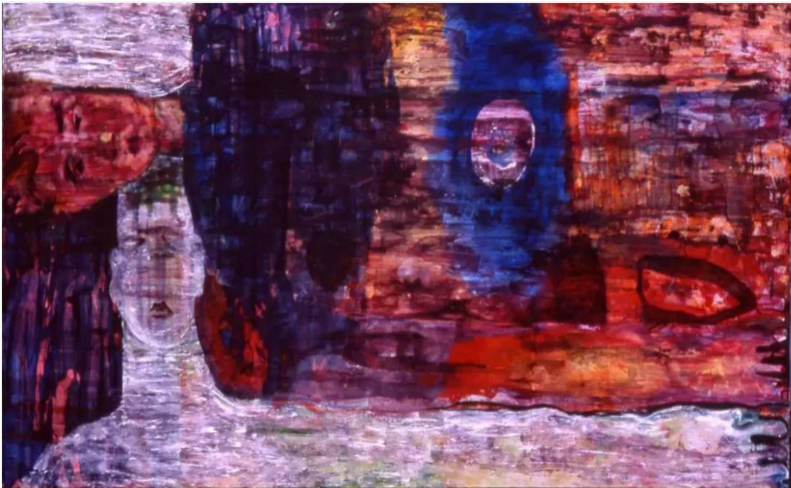
Cold and Hot 冷與熱 Oil on canvas 布面油畫 200x400 cm 1984