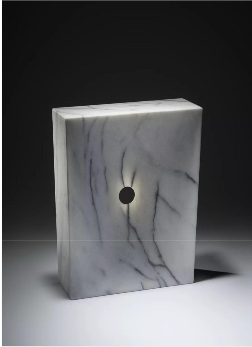
Circle & Square 圓+方 Marble 大理石 10x29x37cm 2017