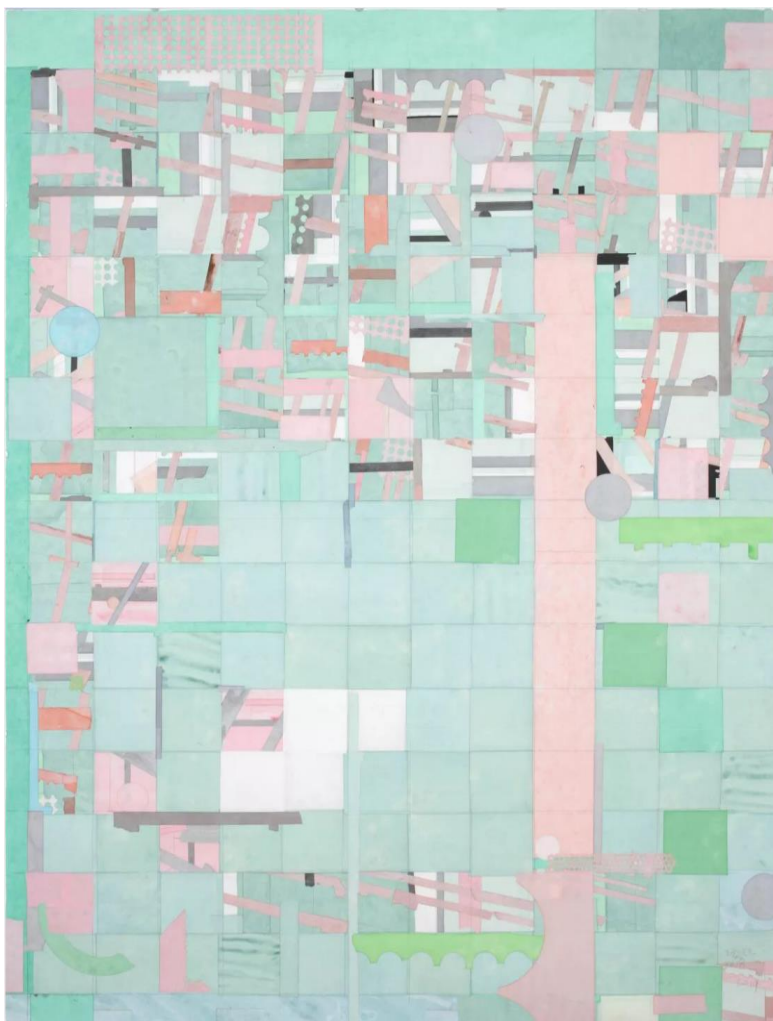
Untitled II 無題(二) Ink on Chinese paper, color collage 宣紙水墨.彩色拼貼 160x122cm 2018