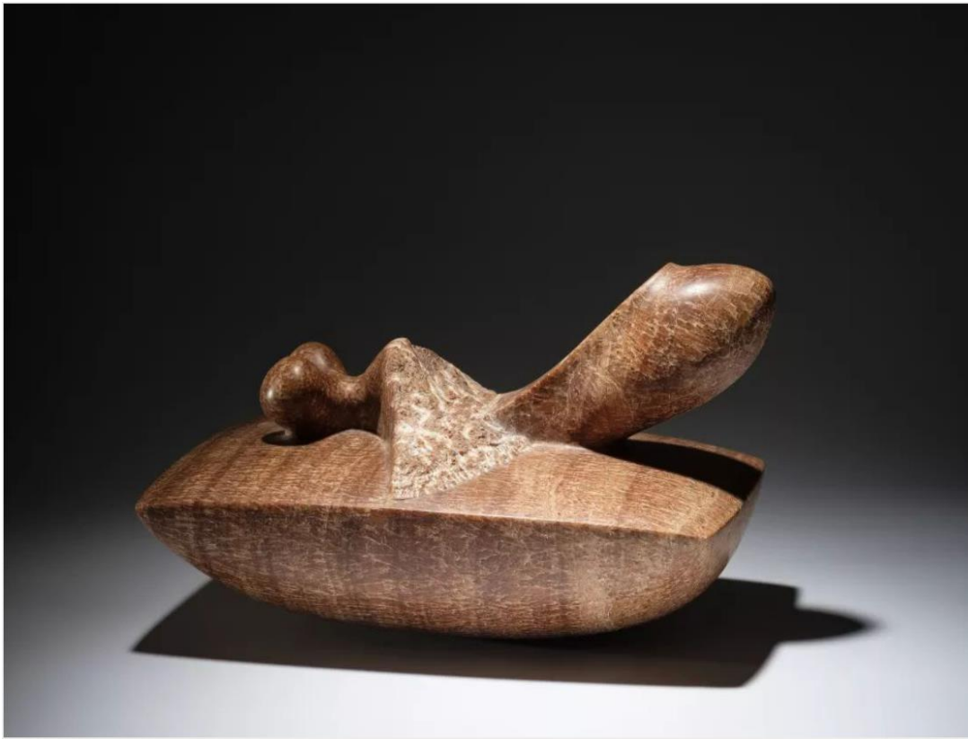
Dragonfly 蜻蜓 Stalactite 鐘乳石 24x26x44cm 1975