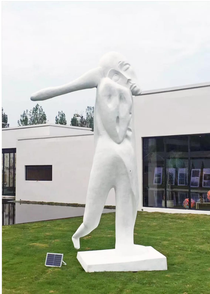
Outstanding In The World 平步青雲 Fiberglass.acrylic 玻璃鋼(F.R.P).丙烯 400x200x120cm 2008