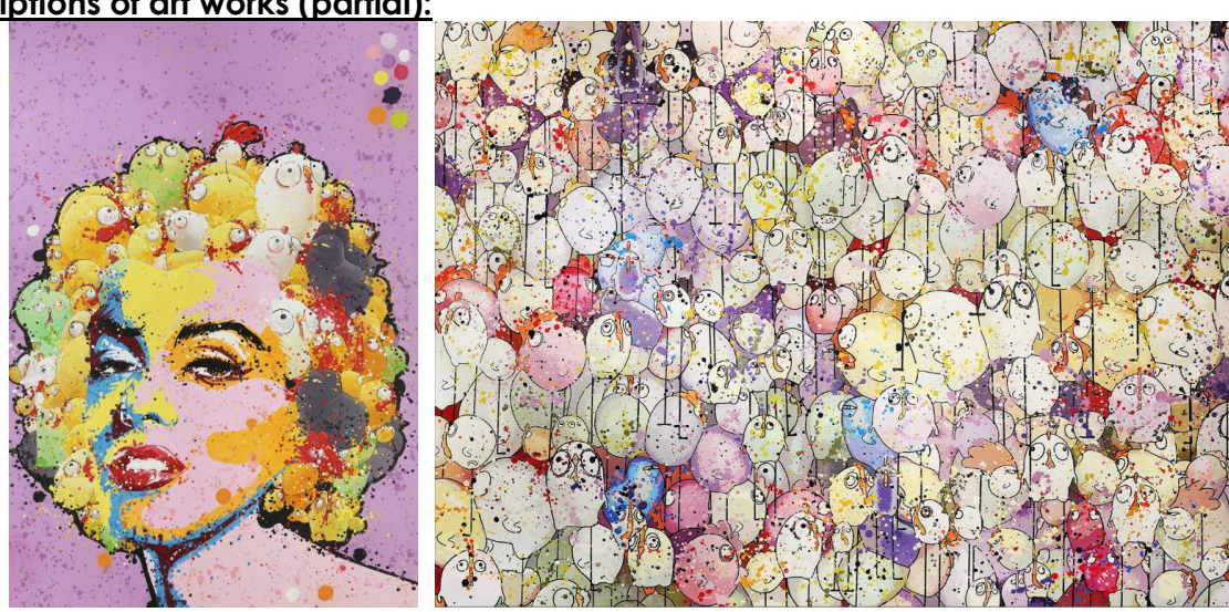
(Left) "Blurry Marylin" and (Right) "Los Chicanos Community"