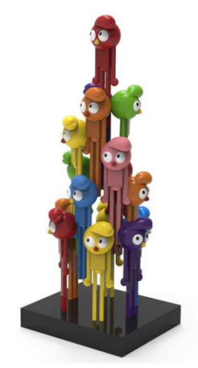
"Donald Trump Rooster" "Donald Trump Rooster" sculpture is humorous and funny!