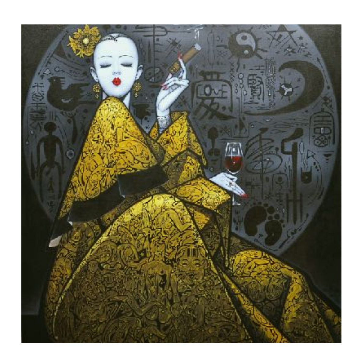
Qiu Shengxian 邱聖賢

Mood 情調 柔情心月170622 Oil and Acrylic on Canvas 布本油畫與丙烯 145 x 145 cm 2017