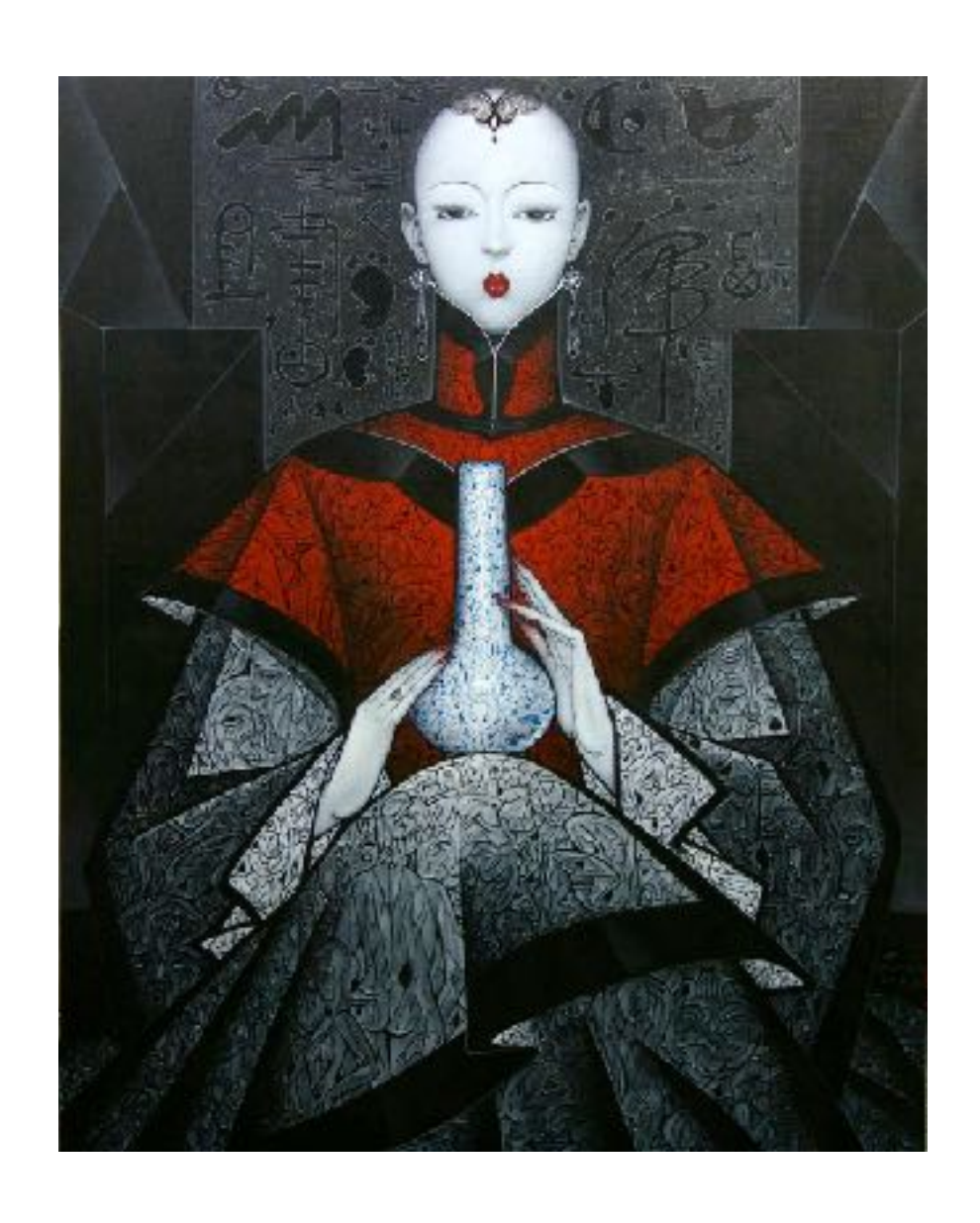
Qiu Shengxian 邱聖賢 Mood 140630 情調140630 Oil and Acrylic on Canvas 布本油畫與丙烯 150 x 120 cm 2014