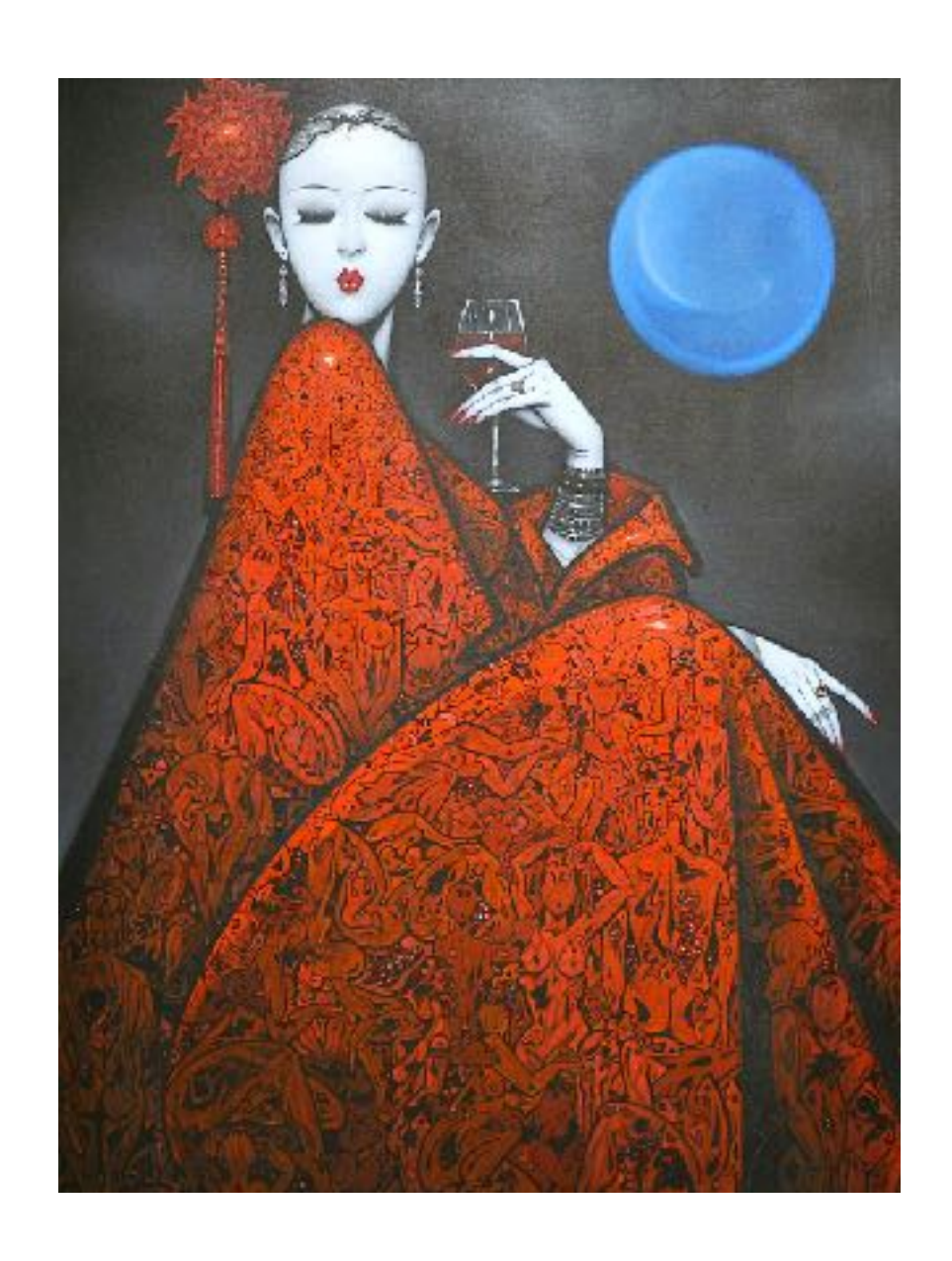
Qiu Shengxian 邱聖賢 Mood 170618 情調170618 Oil and Acrylic on Canvas 布本油畫與丙烯 115 x 150 cm 2017