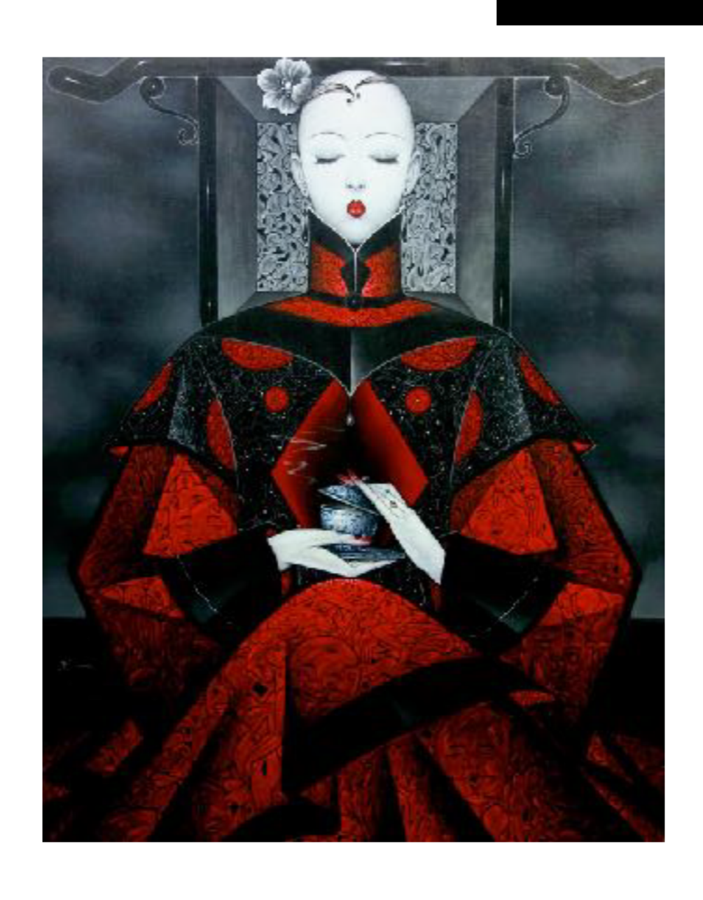
Qiu Shengxian 邱聖賢 Mood 140626 情調140626 Oil and Acrylic on Canvas 布本油畫與丙烯 150 x 120 cm 2014