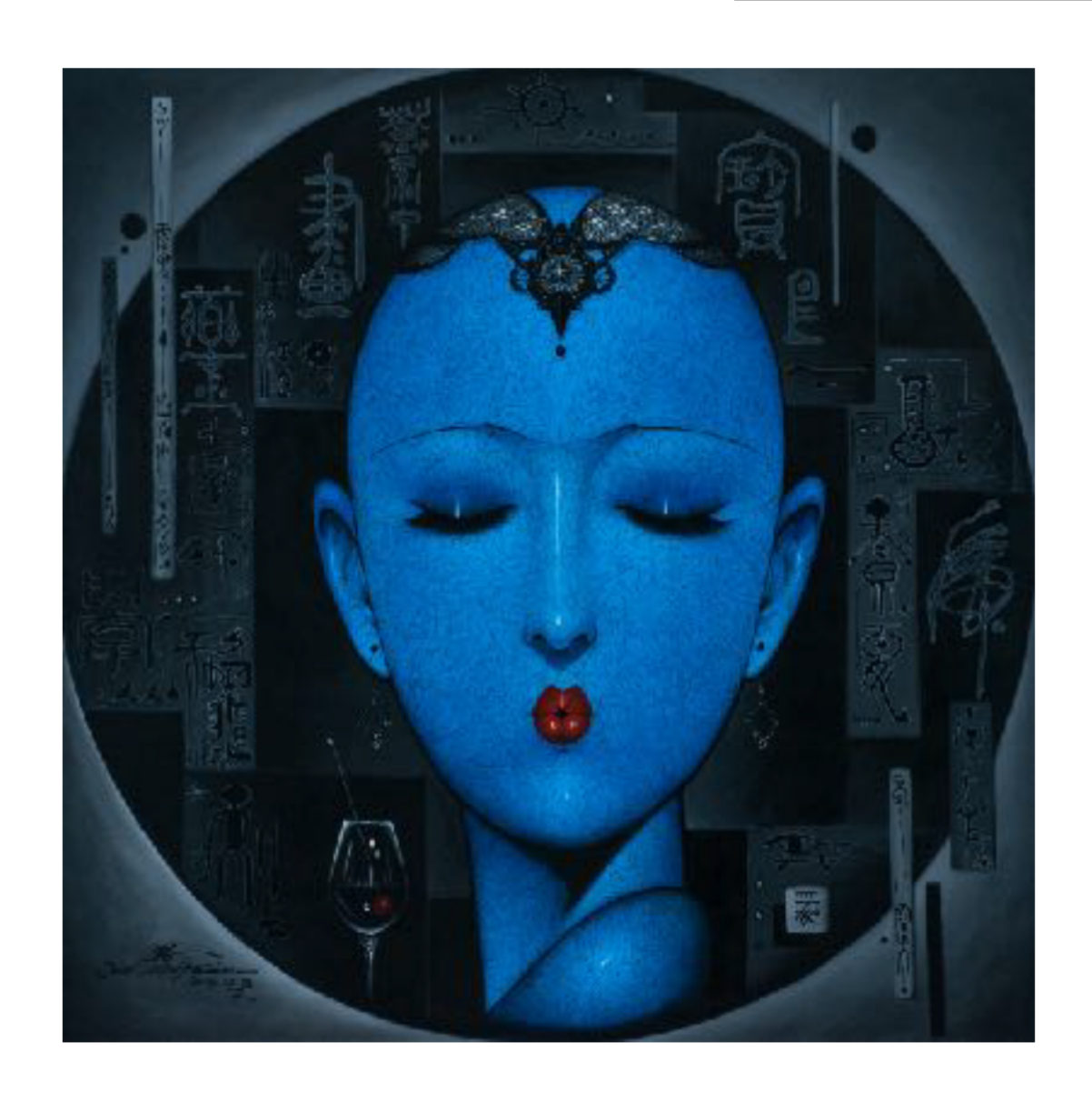
Qiu Shengxian 邱聖賢 Fashion Baby 151208 時尚寶貝 151208 Oil and Acrylic on Canvas 布本油畫與丙烯 145 x 145 cm 2015