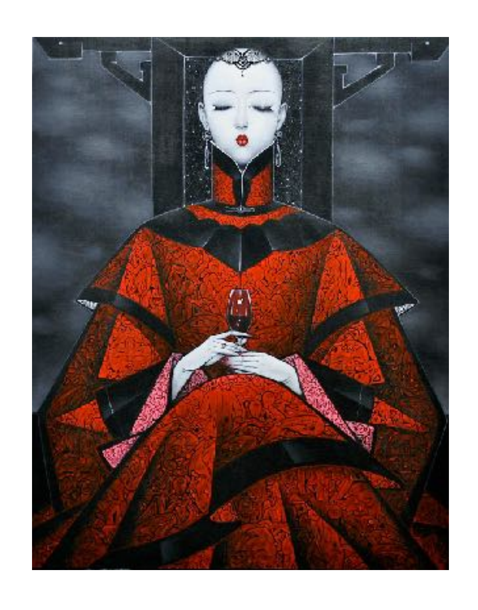
Qiu Shengxian 邱聖賢 Mood 140628 情調140628 Oil and Acrylic on Canvas 布本油畫與丙烯 150 x 120 cm 2014