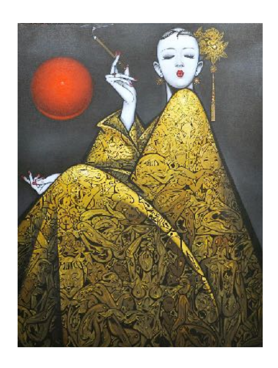
Qiu Shengxian 邱聖賢 Mood 170620 情調170620 Oil and Acrylic on Canvas 布本油畫與丙烯 115 x 150 cm 2017