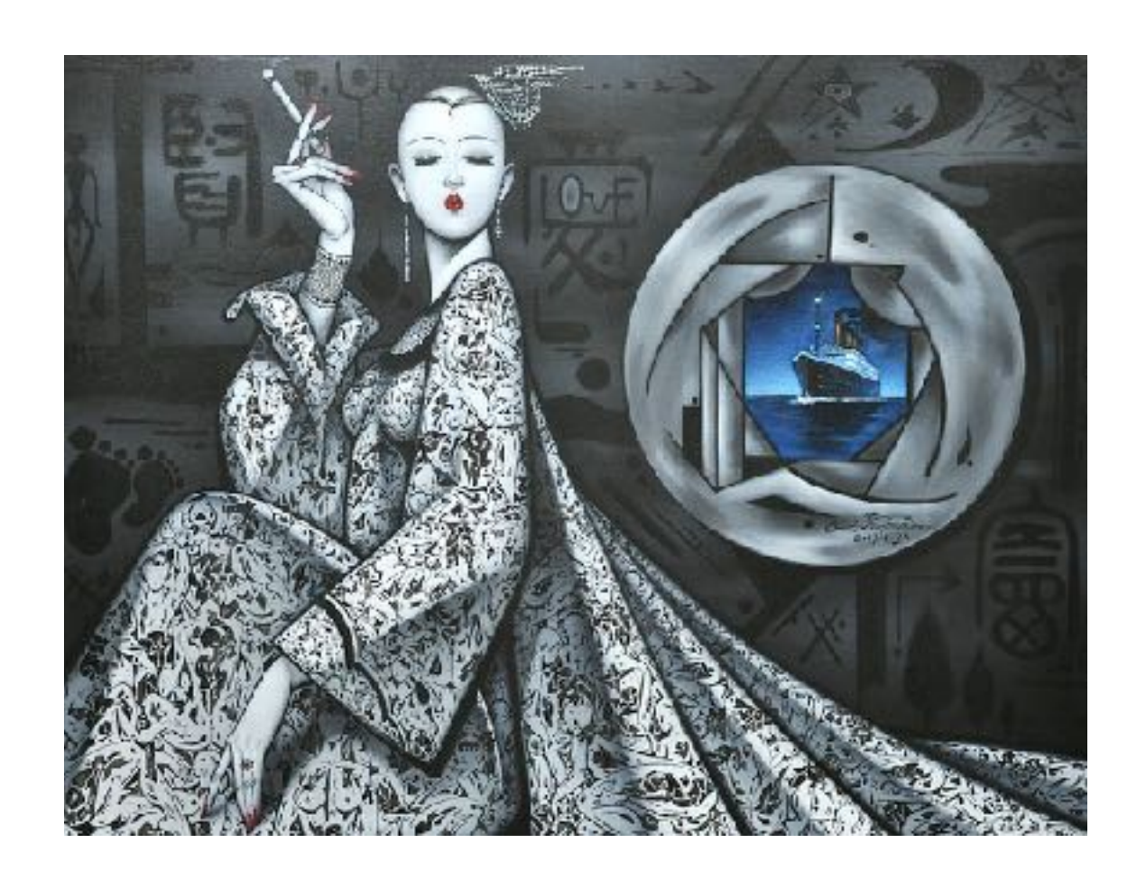
Qiu Shengxian 邱聖賢 Mood 170526 情調170526 Oil and Acrylic on Canvas 布本油畫與丙烯 115 x 150 cm 2017