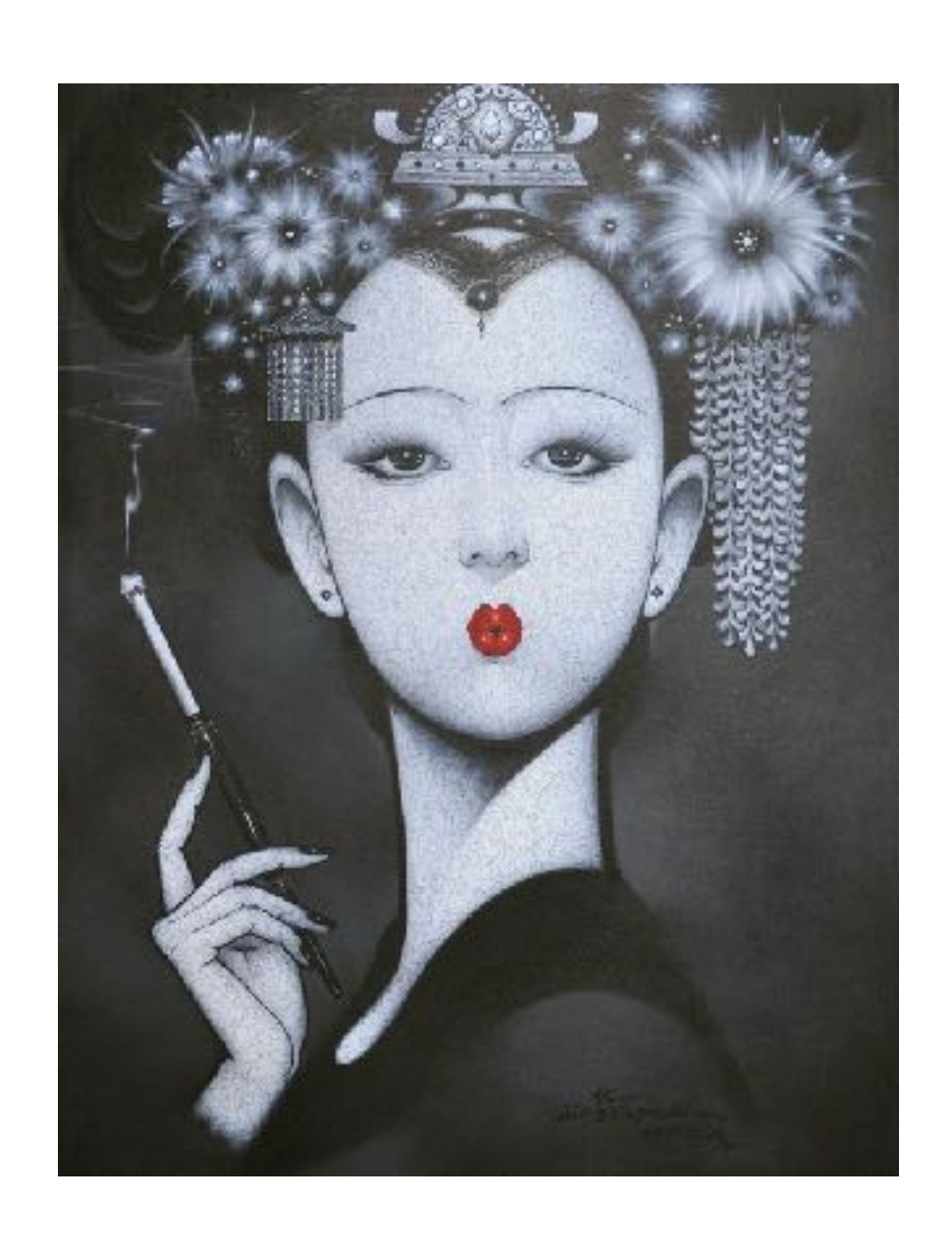
Qiu Shengxian 邱聖賢 Fashion Baby 170928 時尚寶貝 170928 Oil and Acrylic on Canvas 布本油畫與丙烯 150 x 115 cm 2017