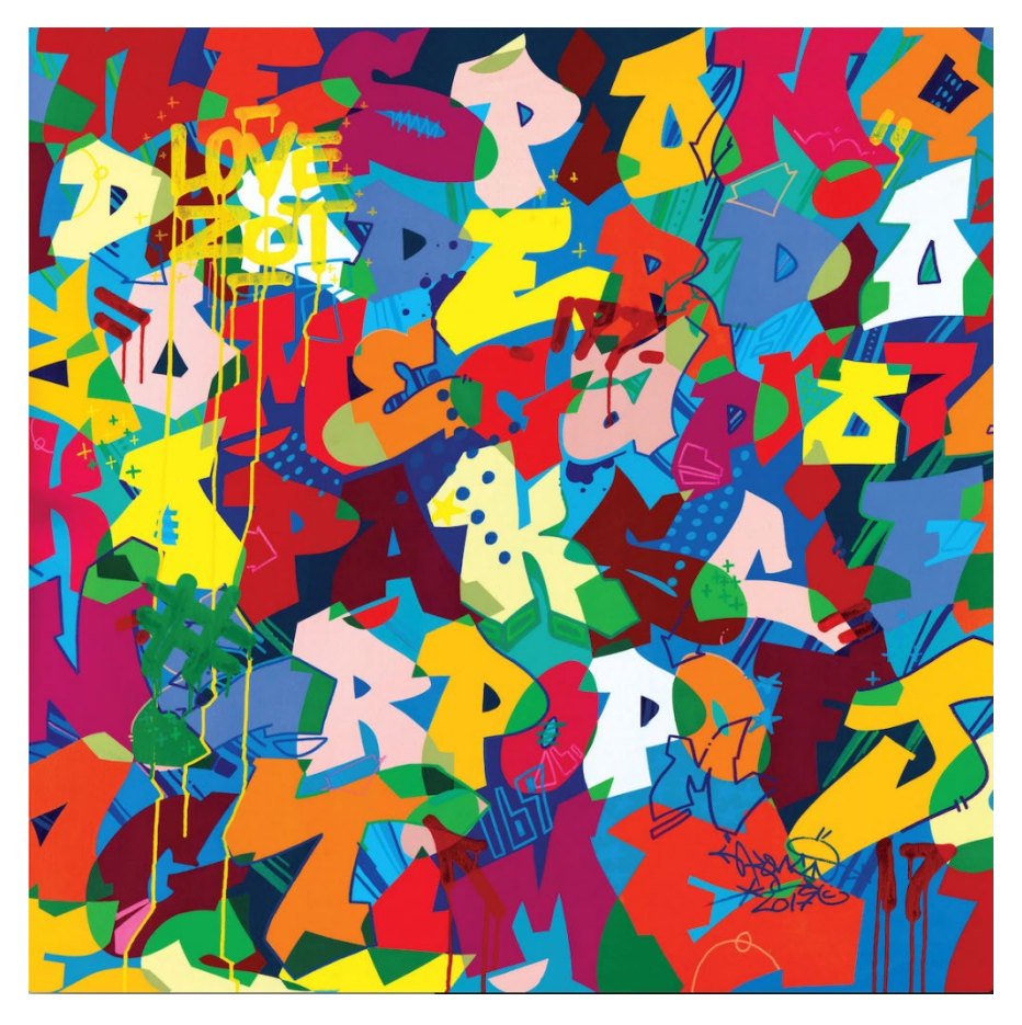
Lanmou pou zot, 100 x 100 cm, Mixed media on canvas