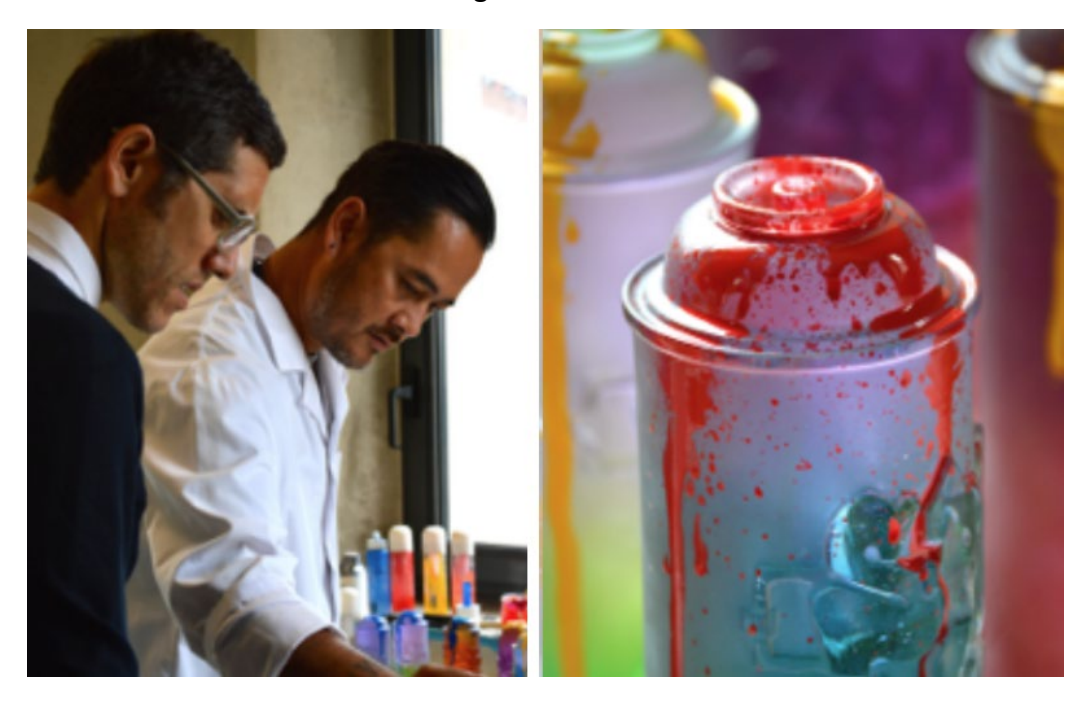
Kongo working with Daum team