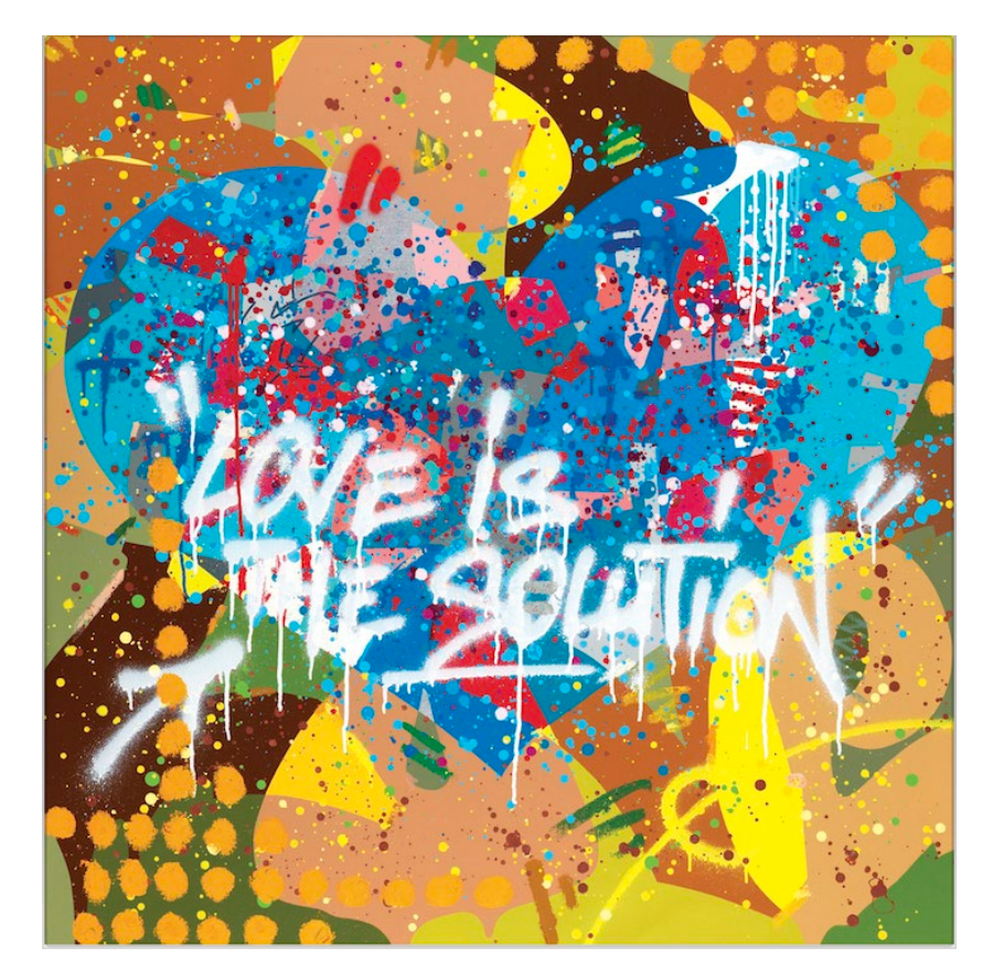
Solutions, 100 x 100 cm, Mixed media on canvas