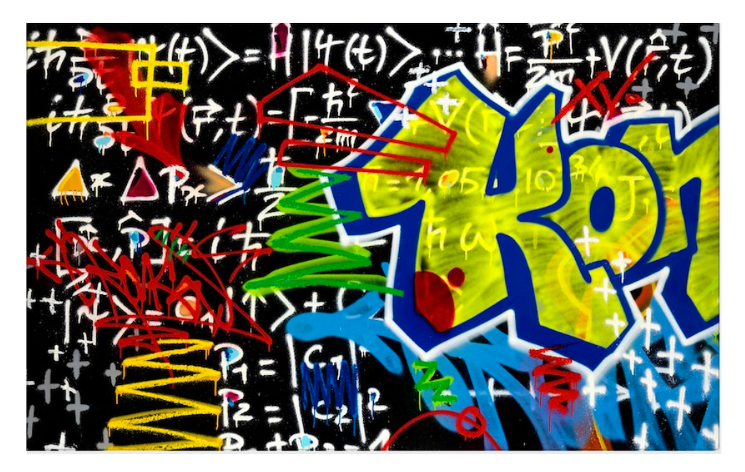
La formule, 130 x 210 cm, Mixed media on canvas